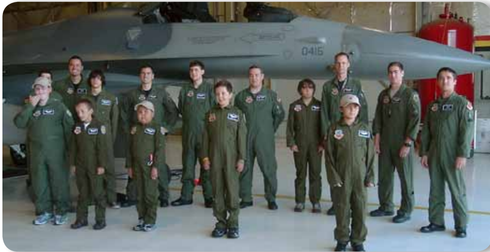
Pilot for a Day: Eight wish kids with an interest in aviation had the opportunity to become a Pilot for a Day at Hill Air Force Base.