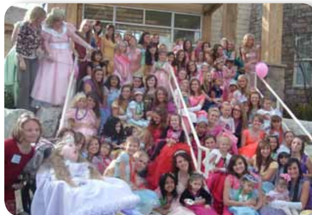
Princess Party: Junior Miss contestants and wish kids dressed as princesses, enjoyed an elegant tea party and dancing at A Wishing Place .

Wish kids and their families participated in this year's annual Easter Egg Hunt.