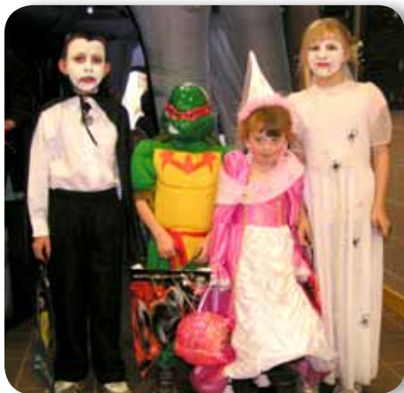
Halloween: Wish kids dress up and attend our annual Halloween Trick or Treat held at A Wishing Place .