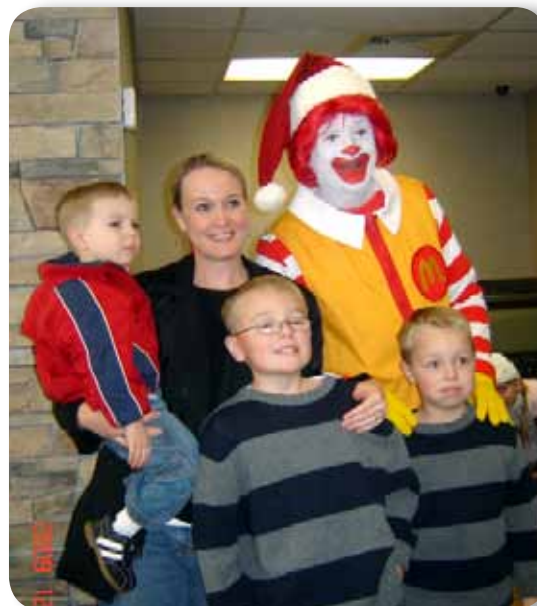
The Polar Express: Many wish families enjoyed meeting Ronald McDonald for lunch before heading to the Polar Express courtesy of KBER 101.